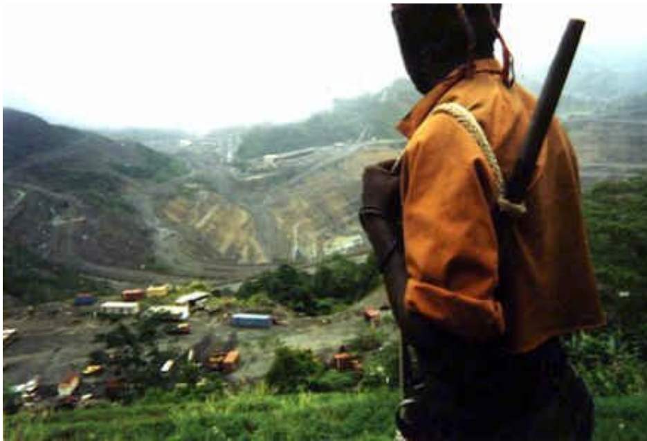
Young freedom fighter from the Bougainville Revolutionary Army with home made shotgun stands guard over the Panguna copper mine.